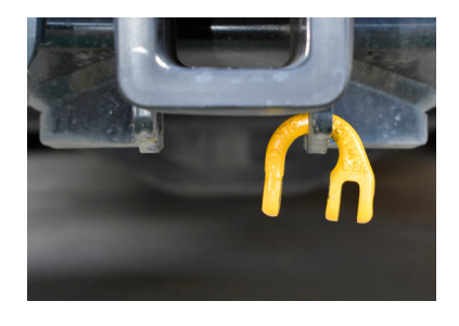
Step 1. Place the first half of the link through the hitch point on either side of the tow bar.