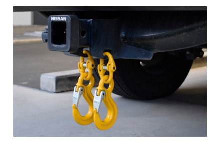
When using two chains, repeat the process on the other hitch point of the tow bar.

Disclaimer: while every reasonable effort has been made to ensure that this document is correct at the time of printing, Hobson Engineering®, its agencies and employees disclaim all liability in respect to anything or the consequences of anything done or omitted regarding the whole or any part of this document.