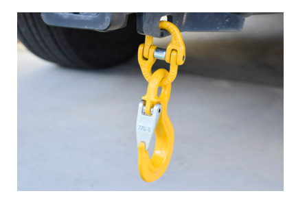
Step 5. Using a hammer, tap the pin through the collar until it emerges on the other side of the links.