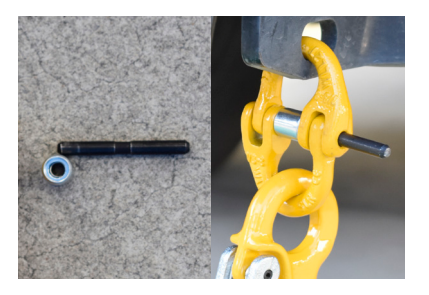
Step 3. Bring the two halves of the links together and partially insert locking pin to hold the parts together.