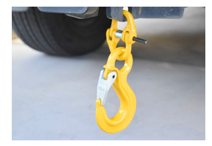
Step 4. Insert the locking collar with the recessed side facing the pin and push the pin in until it holds the collar in place.