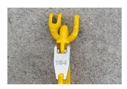
Step 2 . Place the other half of the link through the eye of the hook.